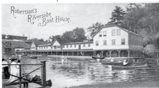
Top: A postcard of the Waltham Canoe Club (no. 22).