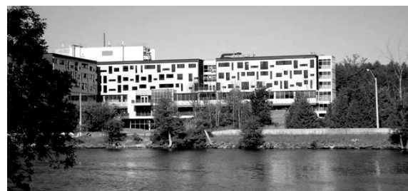
Gzowski College at Trent University