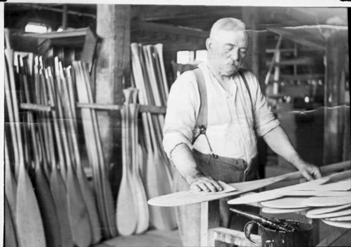
Sanding a paddle