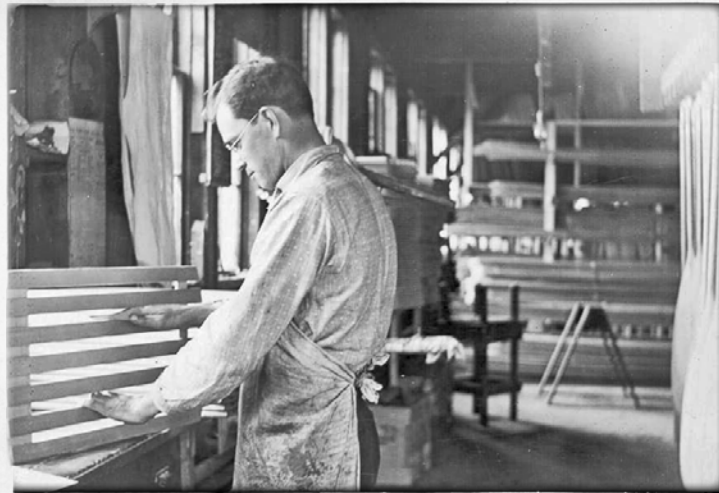
Building a seat back