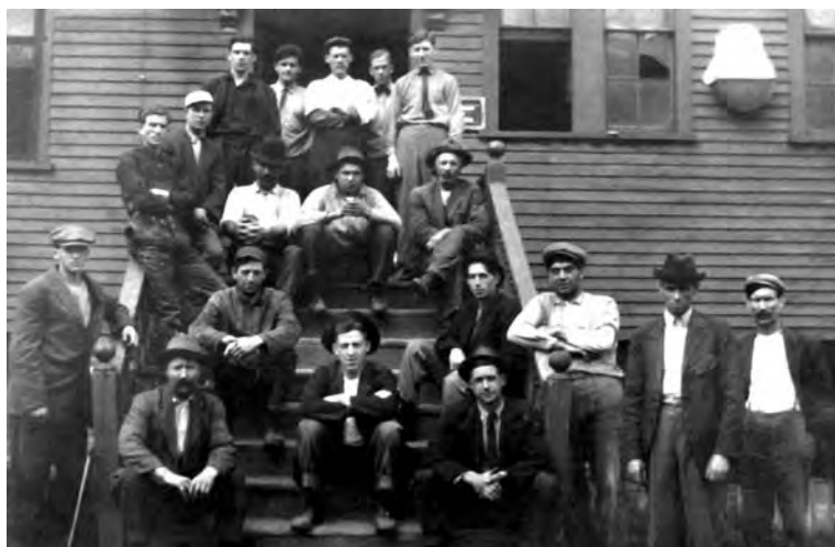
Above. Old Town Canoe Company workers on a postcard from before 1910.