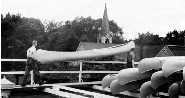
Above and left. The roof of the building was used to store the canoes as the filler dried.